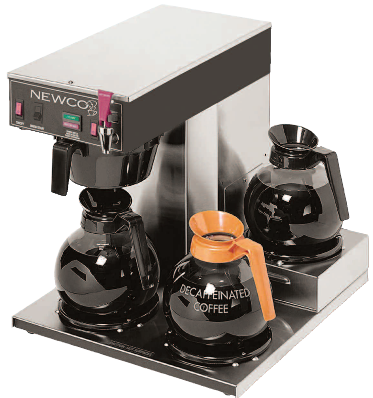
Decanters not included

All the features are built into a stainless steel cabinet for long stability and durability.